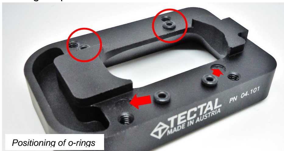
Positioning of o-rings